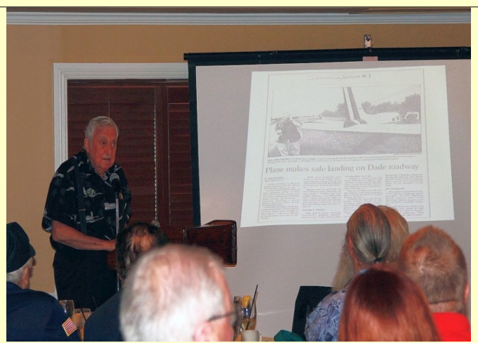
Landing his plane on the roadway!