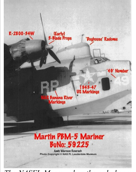
The NASFL Museum has the only known photo of the "real" Training-49 PBM-5 Mariner." — Andy Marocco.